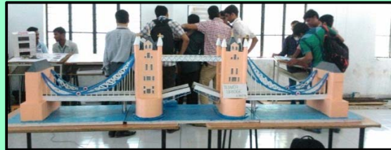
Civil Engineering Model contest and Exhibition