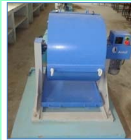
Los Angeles Abrasion testing machine