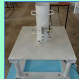
Relative density equipment