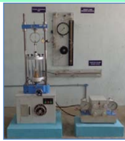
Triaxial Compression Test equipment