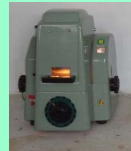
Infra-red Moisture meter