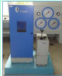
Compression Testing equipment