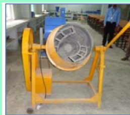
Laboratory Concrete Mixer